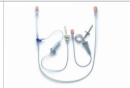
AVA 500 MPAT (part 2 of 2)