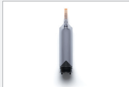
AVA 500 MPAT (part 1 of 2)