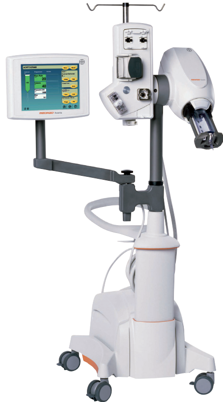
MEDRAD® Avanta Free Standing Pedestal

The pedestal option offers mobility of the injector. A large handle helps you to push the injector. With the table mount option, the injector moves with the table which offers integrated workflow.