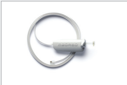
AVA 500 HC *Use with Single Use Hand Controller Sheath