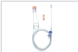
AVA 500 SPAT L