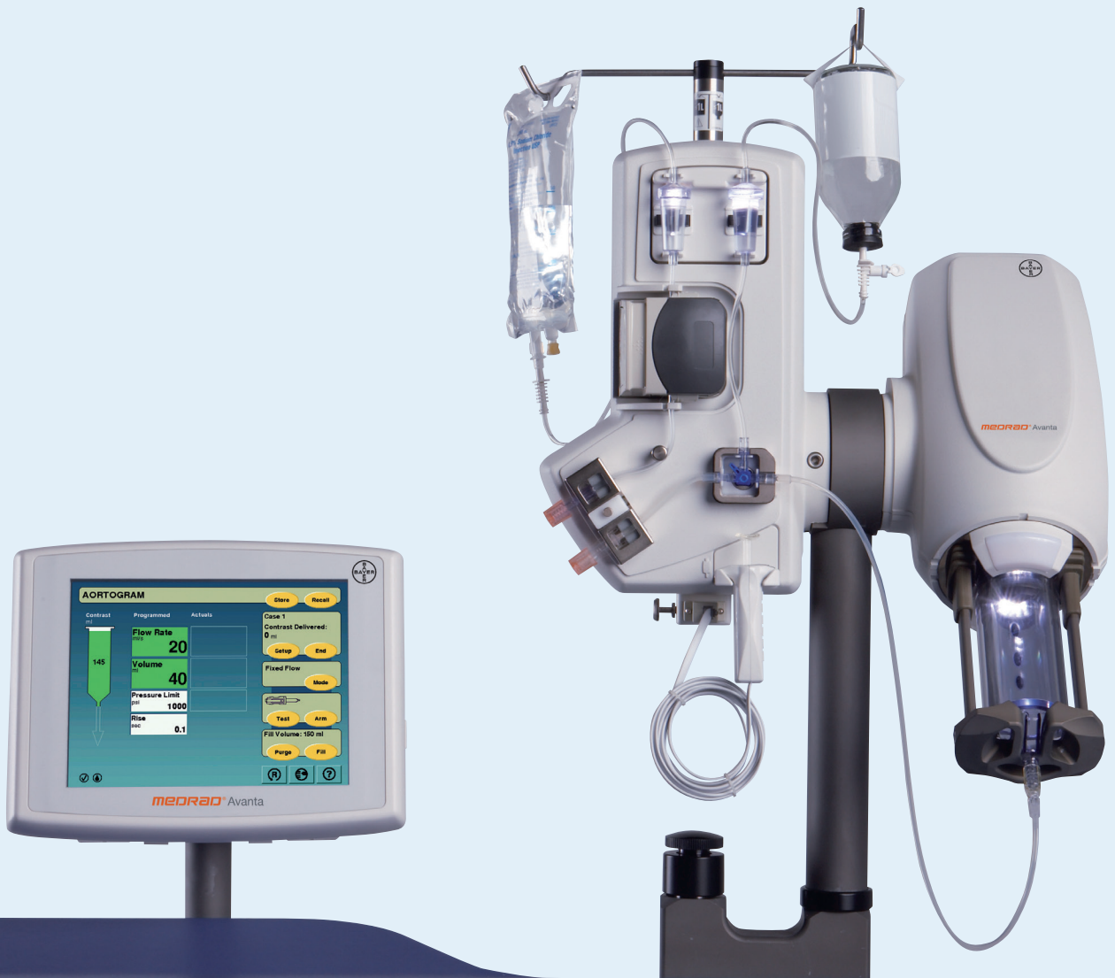
MEDRAD® Avanta Table Mount