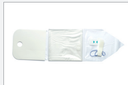
AVA 500 HCS